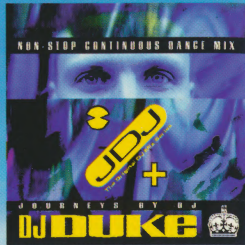
JDJ- DUKE MM 80017